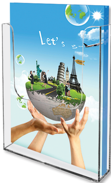
M65, A5 & A4